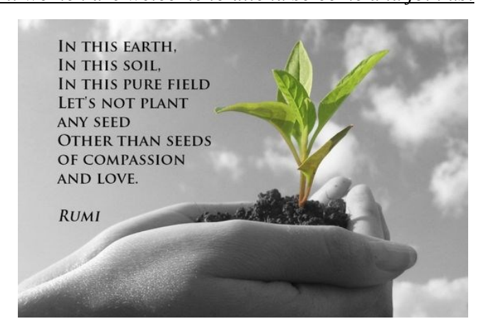
Join the "Seed Project" It starts March 16, 2023—10:30 to Noon United Women of Faith

All women are welcome to attend so come and join us!